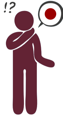
Lump, bump or mass without pain