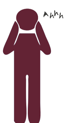
Hoarseness or voice changes