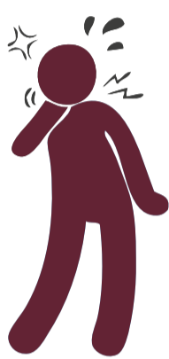
Swelling of throat