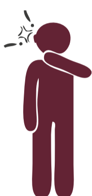
Persistent ear ache or constant pain