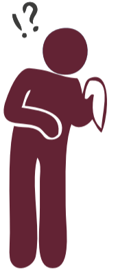
Persistent nasal obstructions or congestions

Any one of these symptoms in the head and neck area could indicate Head & Neck Cancer, contact your GP immediately