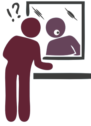
White or red patch